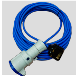
230V EXTENSION CABLE