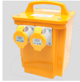
3KVA TOOL TRANSFORMER