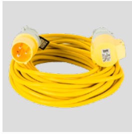
110V EXTENSION CABLE