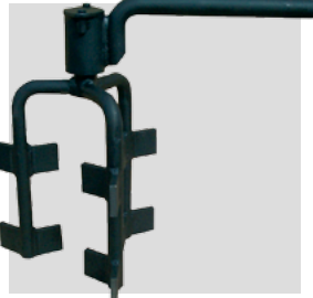
TURBO MIXING ARM