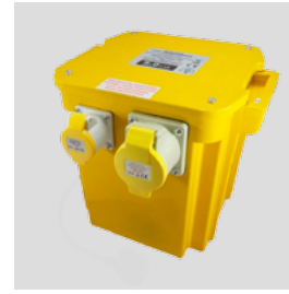
5KVA TOOL TRANSFORMER