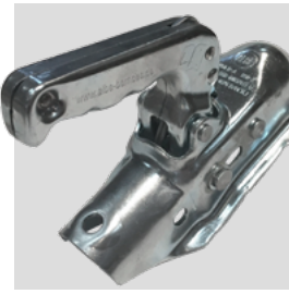
300L TOW COUPLING